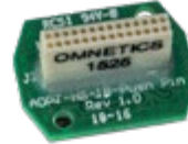
ADPT-HS-18-PUSH-PIN Input: 2x5 833 Mill-Max Output: Omnetics 26 pin