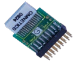
ADPT-HS-18-Versa Input: Mill-Max 18 pin Output: Omnetics 26 pin