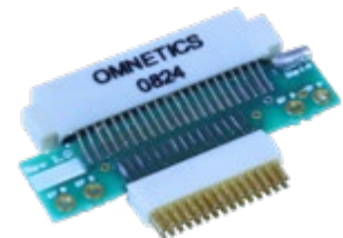
ADPT-HS-36-GMR Input: Omnetics 30 socket Output: Omnetics 44 pin