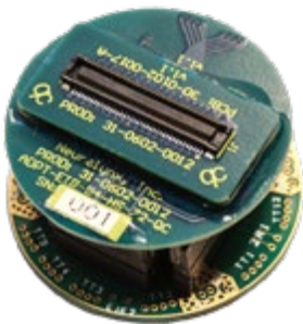
ADPT-EIB-54-HS-72-QC Input: Mill-Max 14/16/18 socket Output: QuickClip 72