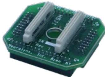
ADPT-EIB-54-Kopf-HS-36 Input: Mill-Max 14/16/18 socket Output: Omnetics 44 pin X 2